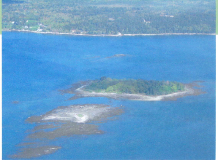
Photo: View of Jed's Island from the air.

HOW MUCH: The purchase price of the island is $750,000 (which is substantially below another purchase offer received by the owners). Maine Coast Heritage Trust, our partner in this project, has secured the opportunity to protect this island through an installment purchase agreement with the owners, who preferred a conservation purchase. Together we must raise $800,000 to cover the payments required by that agreement, as well as long-term stewardship costs.