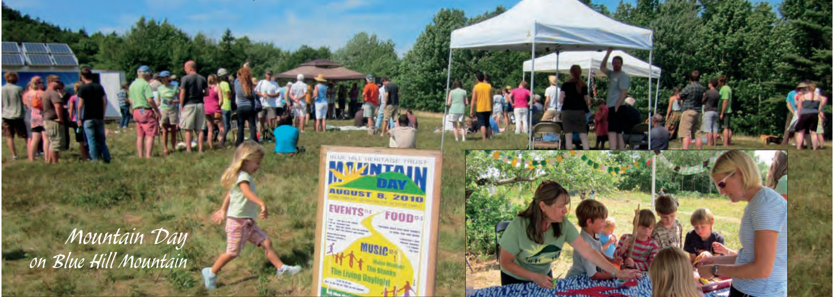
Mountain Day on Blue Hill Mountain