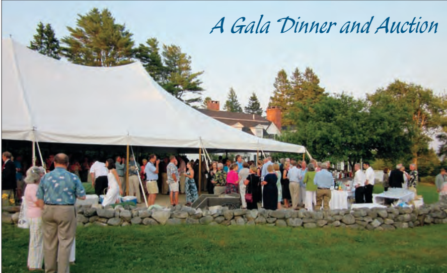
A Gala Dinner and Auction