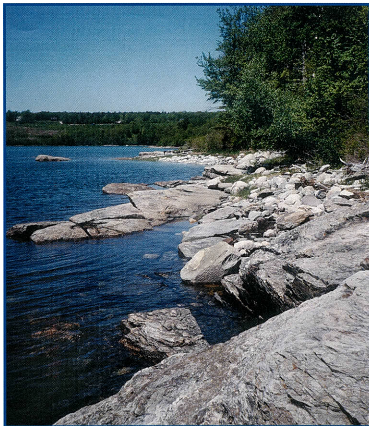
The Campaign added the 25-acre Furth Wildlife Sanctuary, which complements the Carter Nature Preserve at the head of Morgan Bay.

Thank you to everyone who made this achievement possible.