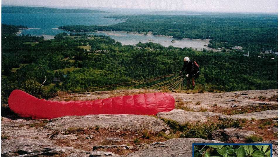
Stewardship of our lands includes managing a variety of recreational uses. Here a paraglider prepares to take off from the top of Blue Hill Mountain.