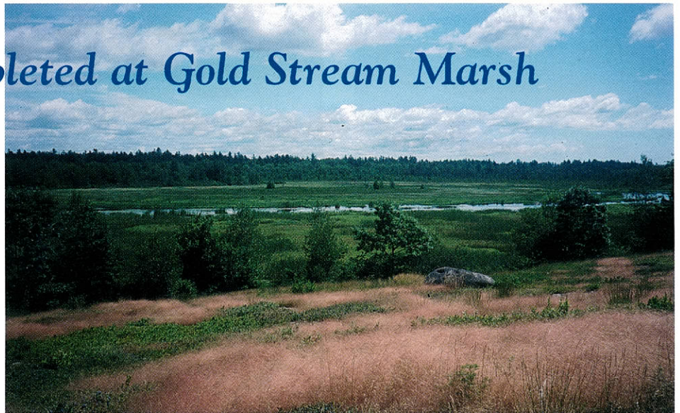
Highly scenic Gold Stream Marsh in Surry is rich with wildlife habitat.

The protection of this land would not have happened but for the devotion of the "Friends of Gold Stream Marsh." They identified the opportunity, made initial contact with the landowner, advocated for its protection, and even began holding yard sales in anticipation of a chance to purchase the land. What they lacked was a partner with experience in land conservation transactions, one able to receive charitable donations and assume the responsibilities of ownership. They came to the Trust. Because the place had the natural values that fit our