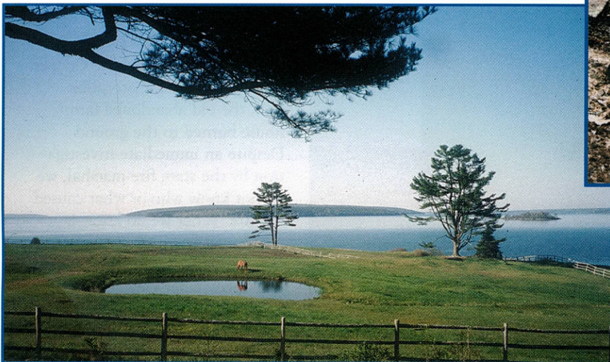
A conservation easement protects the highly scenic values of this privately owned property in Blue Hill, one of 46 properties we monitor at least once a year.

We currently hold conservation easements on 46 privately owned parcels of land throughout the peninsula. Each conservation easement is slightly different in its specific terms, yet each places permanent legal restrictions on the future use of the property so as to permanently protect the scenic, ecological, agricultural, recreational or other conservation values of the land. Our stewardship responsibility is to ensure that those restrictions are not violated. We do this by regularly monitoring the condition of these lands, by visits and by aerial inspection. We also work to maintain a positive relationship with each landowner through regular communication, since a conservation easement in effect makes the Trust and the landowner “conservation partners.”