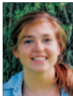
Summer Trail Intern