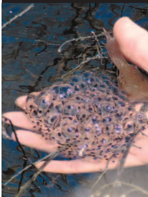
A cluster of Wood Tree Frog eggs.

Help conserve the places that both wildlife & people need.