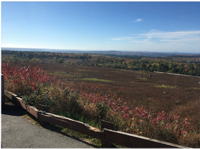
The view from the top of Caterpillar Hill

The view from the top of Caterpillar Hill is one of the prettiest in the area. I really enjoyed taking a walk on this property. There were many interesting spots to stop and see diverse types of nature. The moss was particularly pretty.