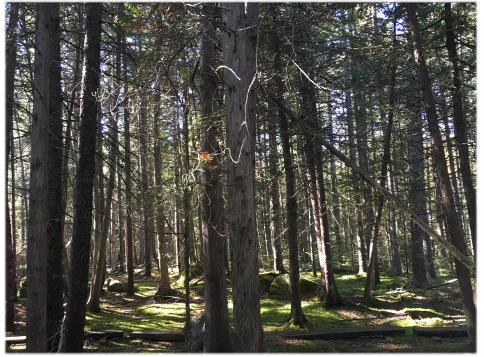
Beds of moss