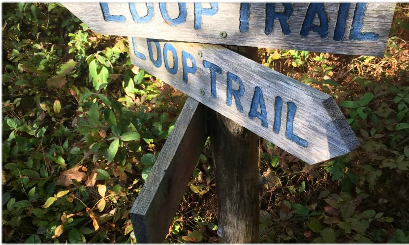
Trail sign at Cooper Farm

Newsletter of the Blue Hill Heritage Trust