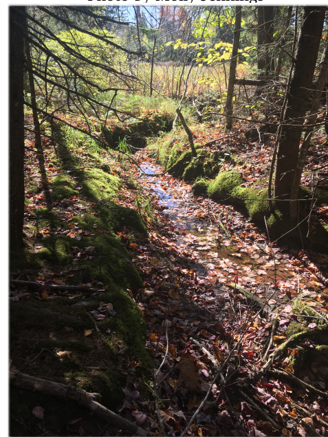
A brook in the Weinland Nature Study Area