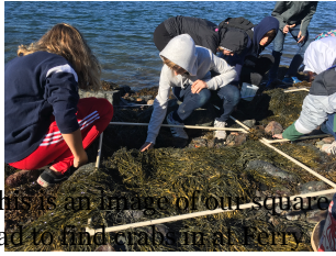
This is an image of our square we had to find crabs in at Ferry Landing.