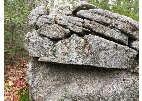
These are all images of a rock moved by glaciers