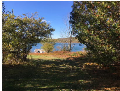
This is an image of the opening of the trees and the Bagaduce River in the background.

The Ferry Landing trail is around 1 mile long. The hike was really nice. It was a really pretty view of the water once we got there. There was a lot of Coral fungus. The water was really cold. Across the river there is an island. It's called Negro Island. It was a way station to the Underground Railroad when slaves were escaping to Canada. The little island is owned by TCT.