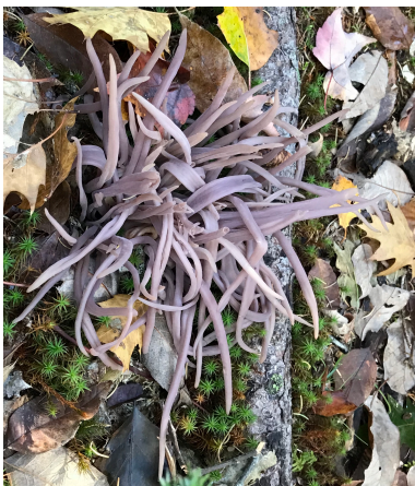
This is an image of the Coral fungus we found along the trail.