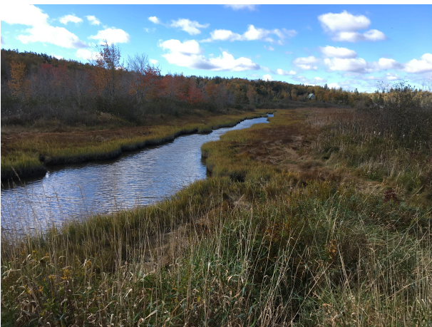
This is an image of the British Canal.

Hatch Cove and Schumacher's Preserve is in Castine. We went there on 10/18/18. Hatch Cove has been a pasteurized field for over 100 years. Schumacher's Preserve is a place that was important from Revolutionary War. There is a v-knot shape down the trail from where people used to scope out the troops. A lot of soldiers died there. Chief Madockawando would be there in the early summer months with his tribe. They would move with the seasons. In the winter they would move to walkers pond in Sedgwick. They would go up the Bagaduce River instead of going around Cape Rosier because