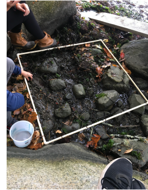
This is an image of our group at Snows Cove looking for Green Crabs.