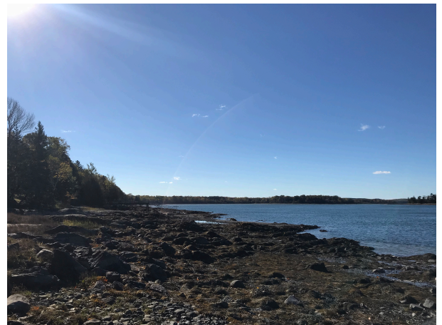
This is an image of the Bagaduce River from Ferry Landing.