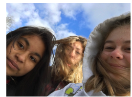
Hatch Cove/ Schumacher Preserve